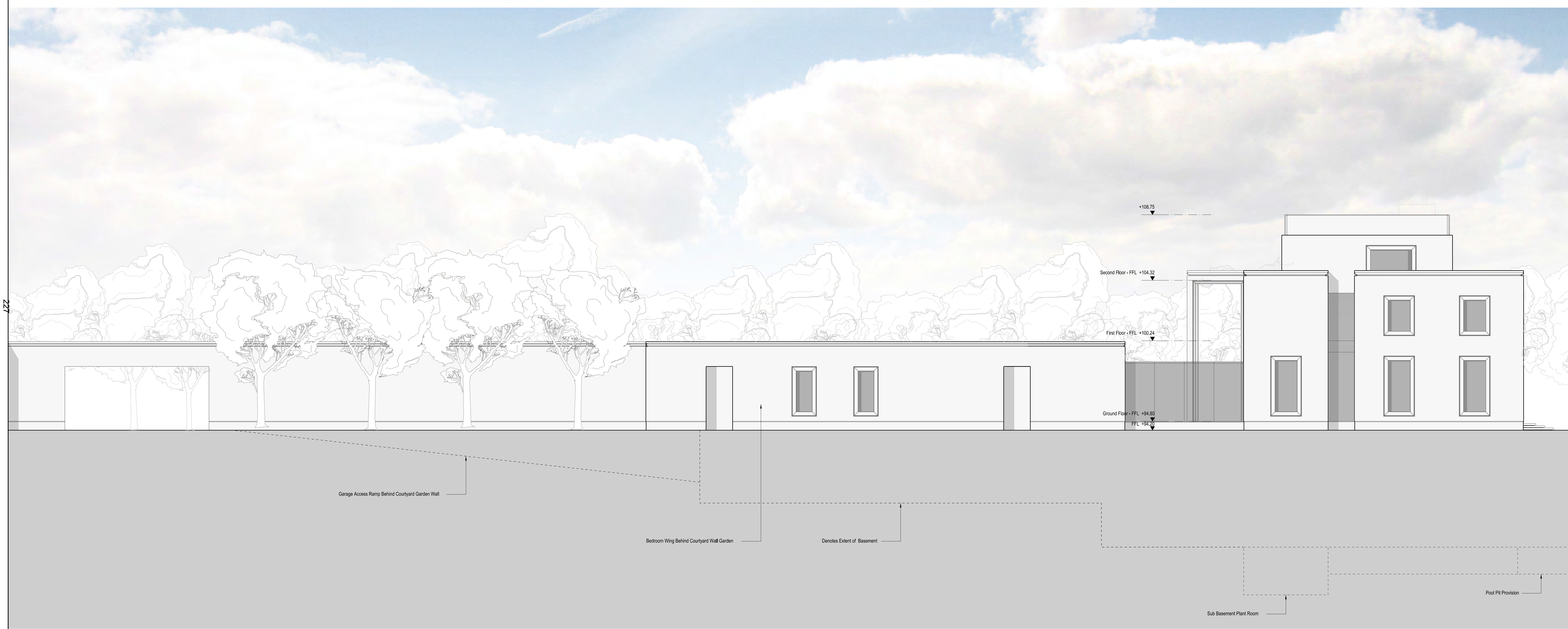
01 West Elevation 1:100